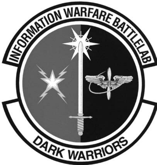
Air Force Organizational Emblem: Information Warfare Battlelab, Air Intelligence Agency.

The public relations industry web site Brandchannel.com describes branding as “a collection of perceptions in the mind of the consumer.” A brand is very different from a product or service. The Army and other military branches have had many slogans that help fashion their brand. “Be All You Can Be,” for example, was named the second most popular advertising jingle of the last century by Advertising Age magazine.